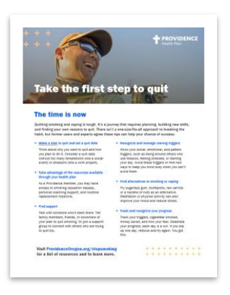
Tips for quitting tobacco flyer