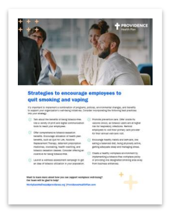
Strategies to encourage employees to quit smoking and vaping