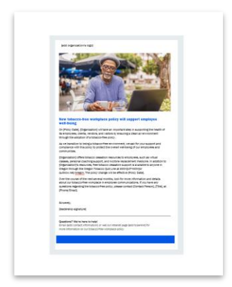
Tobacco-free workplace announcement email