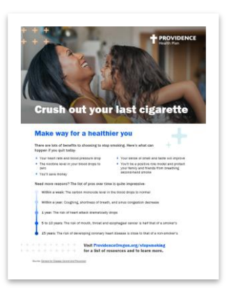
Benefits of quitting tobacco flyer