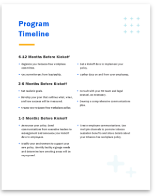
Tobacco-free workplace timeline