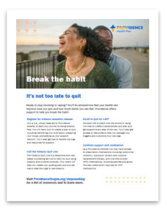
Providence Resources flyer