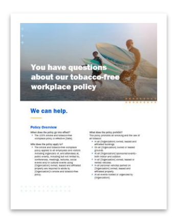
Tobacco-free workplace announcement flyer