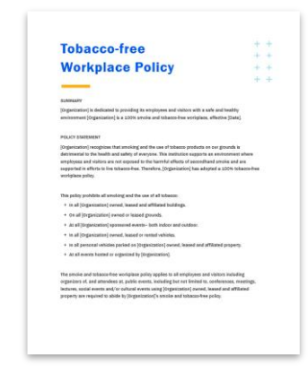
Tobacco-free workplace policy